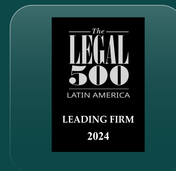
Recognized in the category "City Focus - Curitiba - Leading Firms"