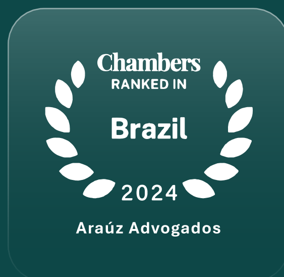
General Business Law: Paraná "Reference in Agribusiness"

We are widely recognized in our practice. Our lawyers have been recognized by prestigious national and international publications. Recognitions such as those achieved until today show the evolution of our legal practice throughout the country.